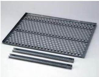
Shelf plate and brackets